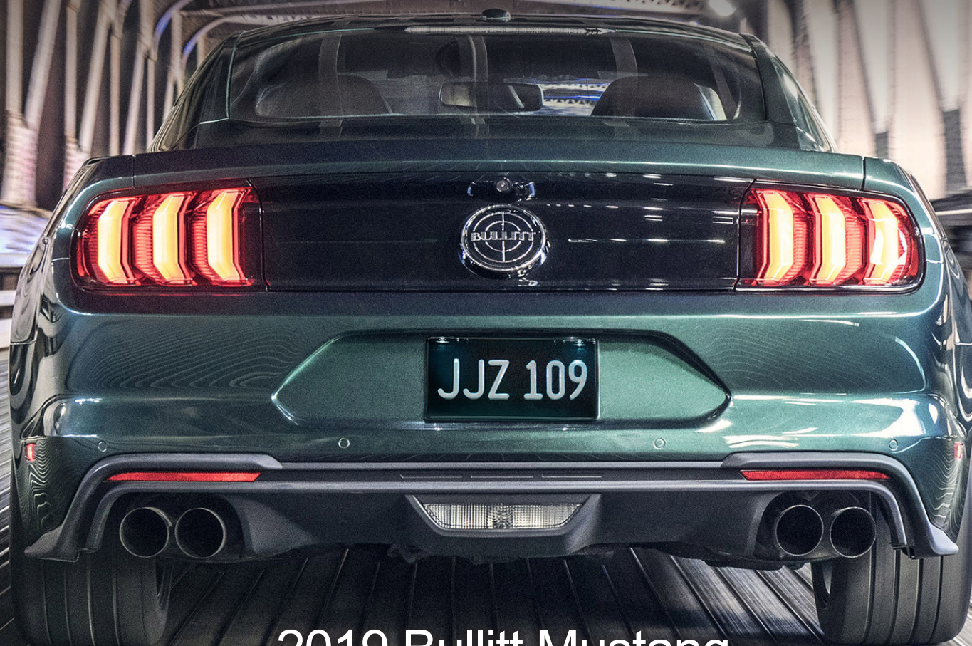
2019 Bullitt Mustang