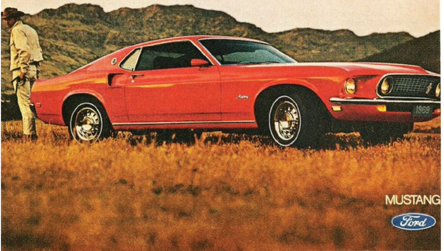
1969 Mustang Sportsroof 2+2