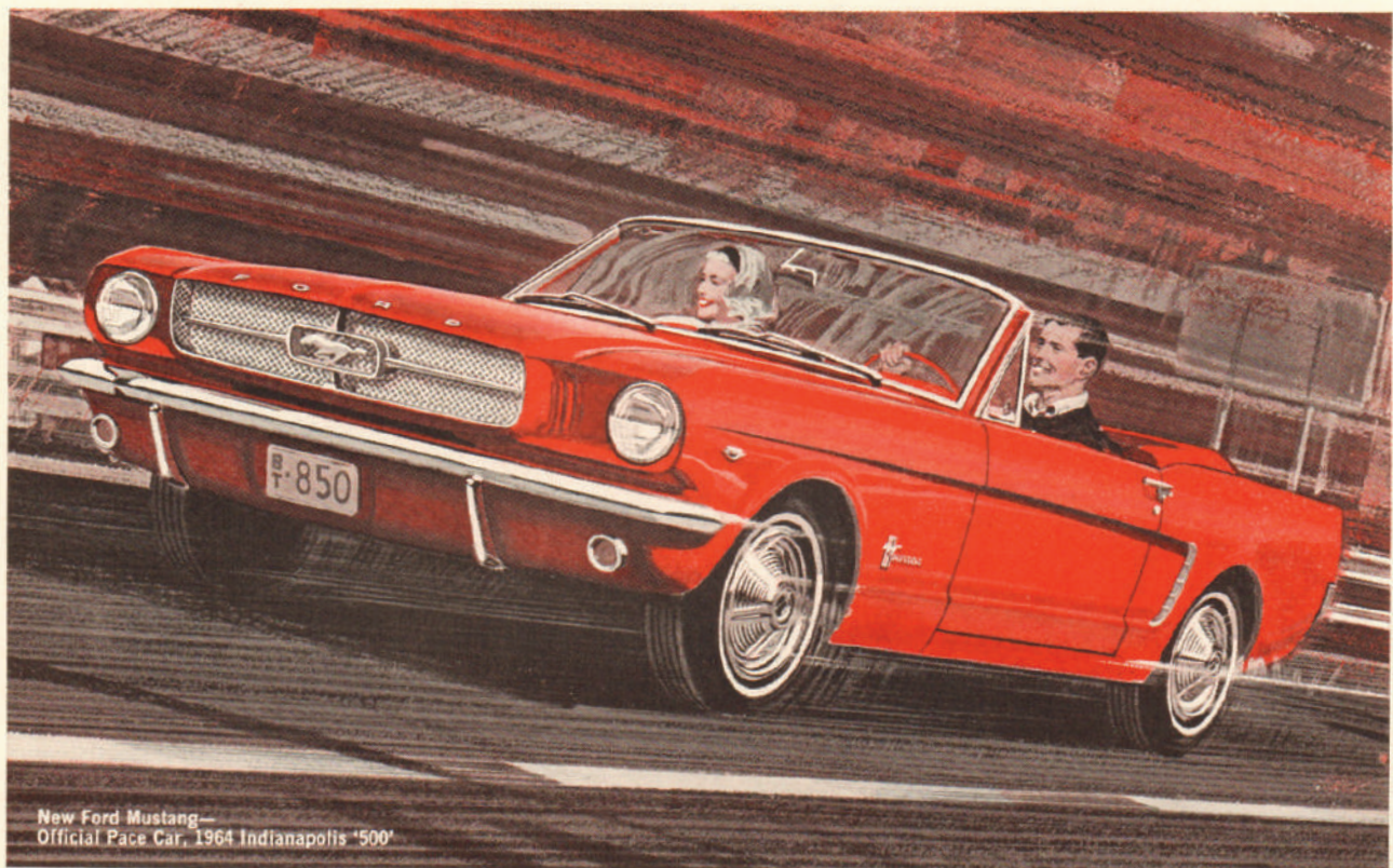
New Ford Mustang— Official Pace Car, 1964 Indianapolis '500'

Here's the Sweepstakes to end all sweepstakes. Command Hair Dressing gives you 70 chances to win the hottest sportscar in years!